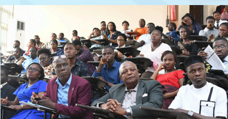
Participants at the 3rd Public Health Grand Round