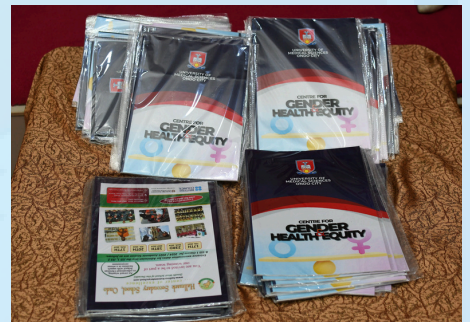
Center for Gender and Health Equity Magazine