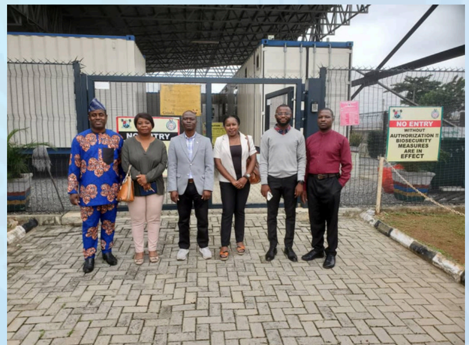
Study Visit by Members of UNIMED's Centre for Molecular Biosciences and Medical Genomics to the Lagos State Biobank