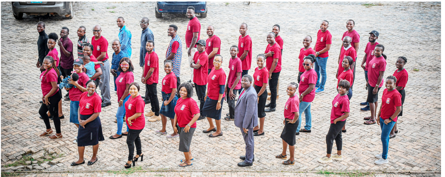
Staff of Faculty of Basic Medical Sciences during their Week