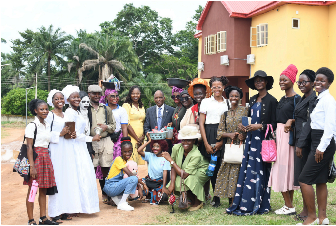
Nursing Students with the VC during their Week's Costume Day