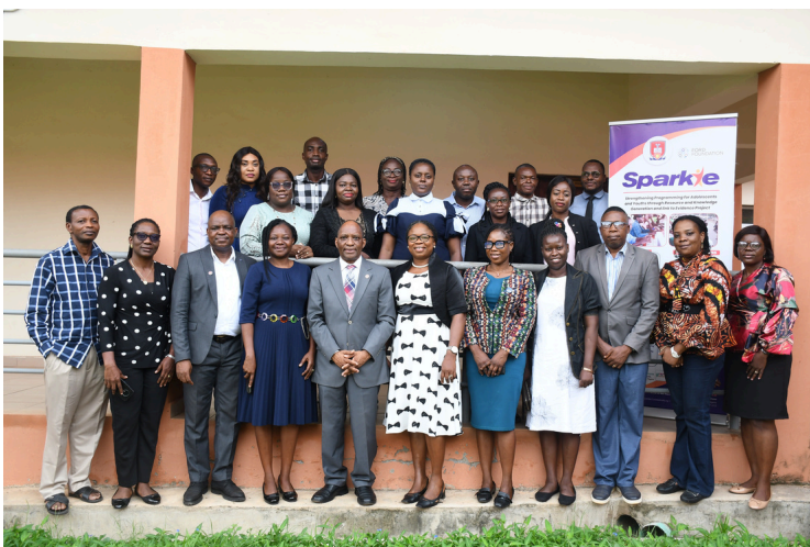
Group photograph of the training of SPARKLE Project new cohort of Fellows