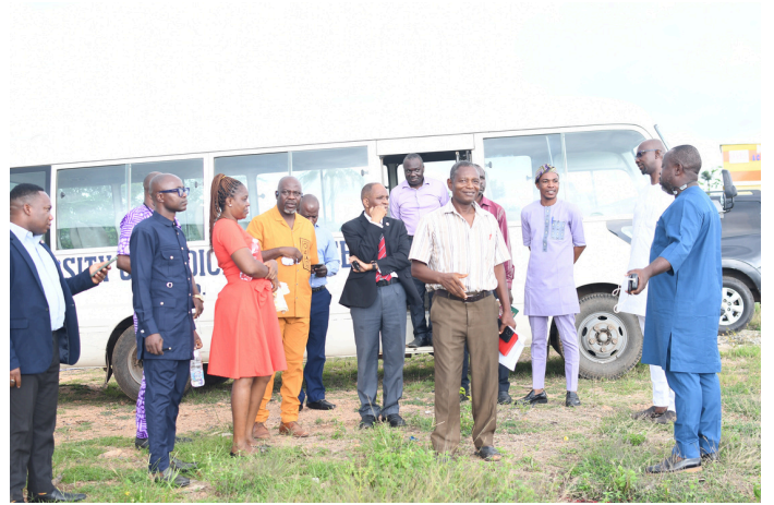
Visit of the Company to Invest in an Inverter Farm for 24-hour Electricity Supply to UNIMED