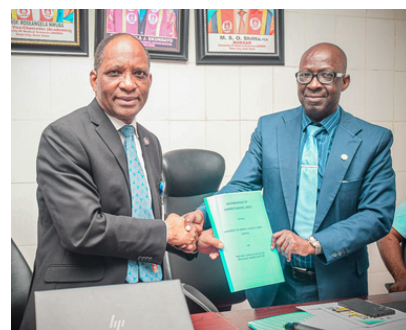
Memorandum of Understanding Signed between UNIMED and West African College of Physicians (WACP)

https://tribuneonlineng.com/unimed-partners-wacp-to-train-medical-doctors-in-clinical-studies/