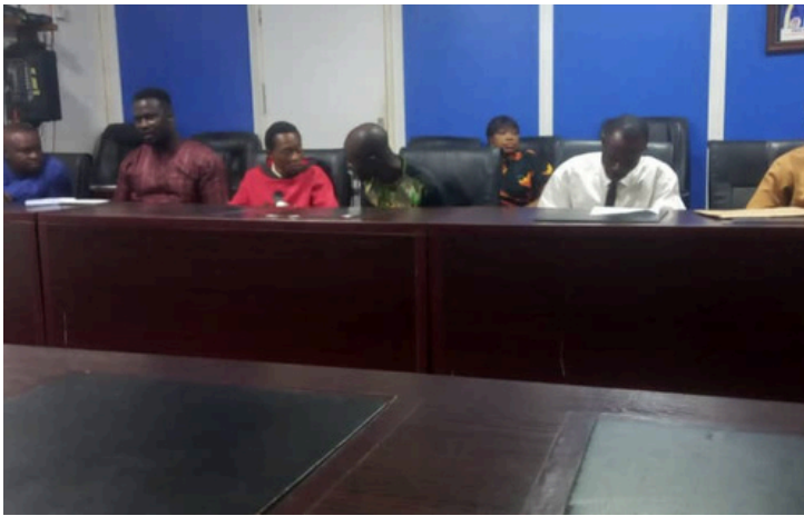
Leaders of JAC at the Wage Award Payment meeting with the Management on Tuesday, 2nd July, 2024