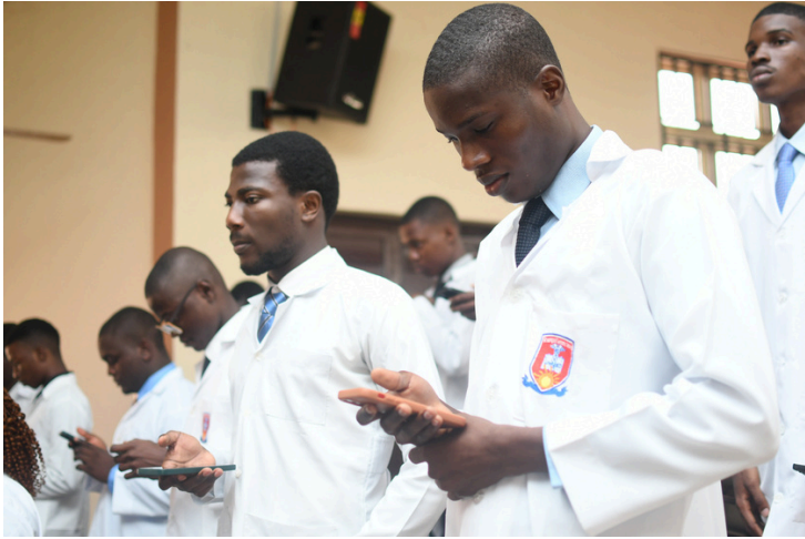
Students taking oath at the white coat ceremony