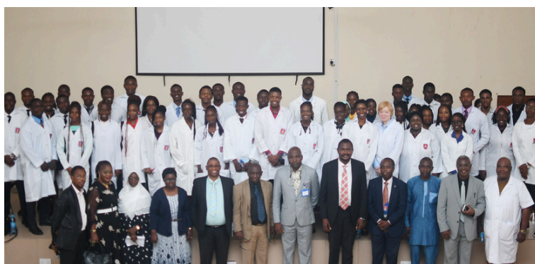
Group photograph of the white coat ceremony