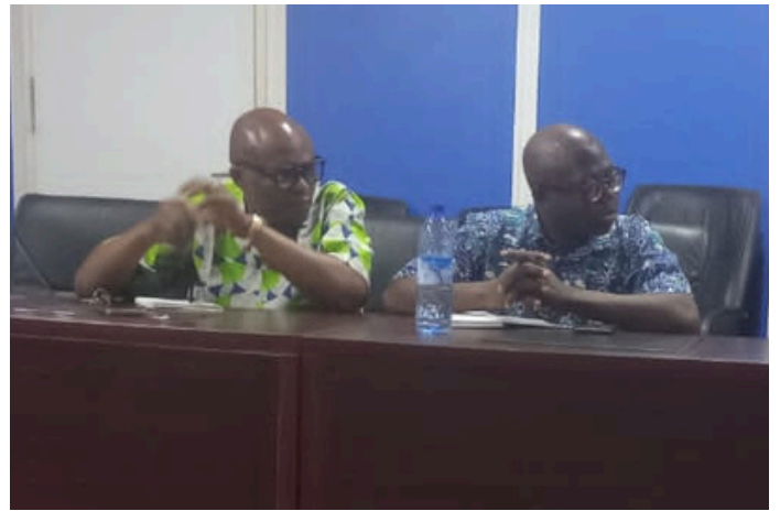
Leaders of ASUU at the Wage Award Payment meeting with the Management on Tuesday, 2nd July, 2024