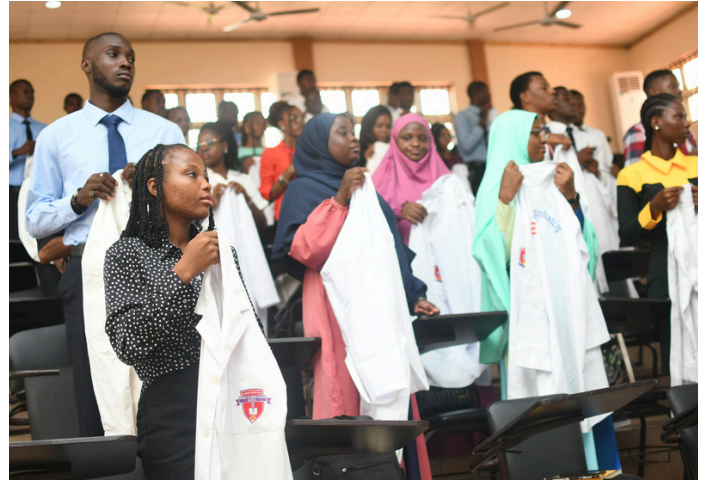
Donning of coats by students at the white coat ceremony