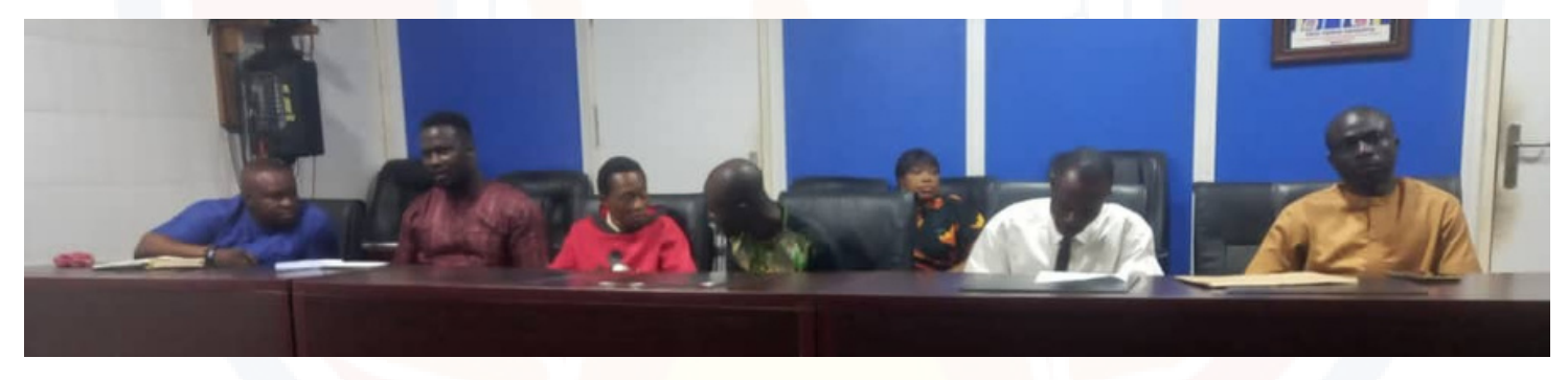
Leaders of UNIMED JOINT ACTION COMMITTEE (JAC)

The welfare of staff, as always, will be prioritised, within the available resources as staff form the engine that drives the activitiesuniversity's key teaching, research and community service. No university will undermine the welfare of its staff and UNIMED will not be an exception.